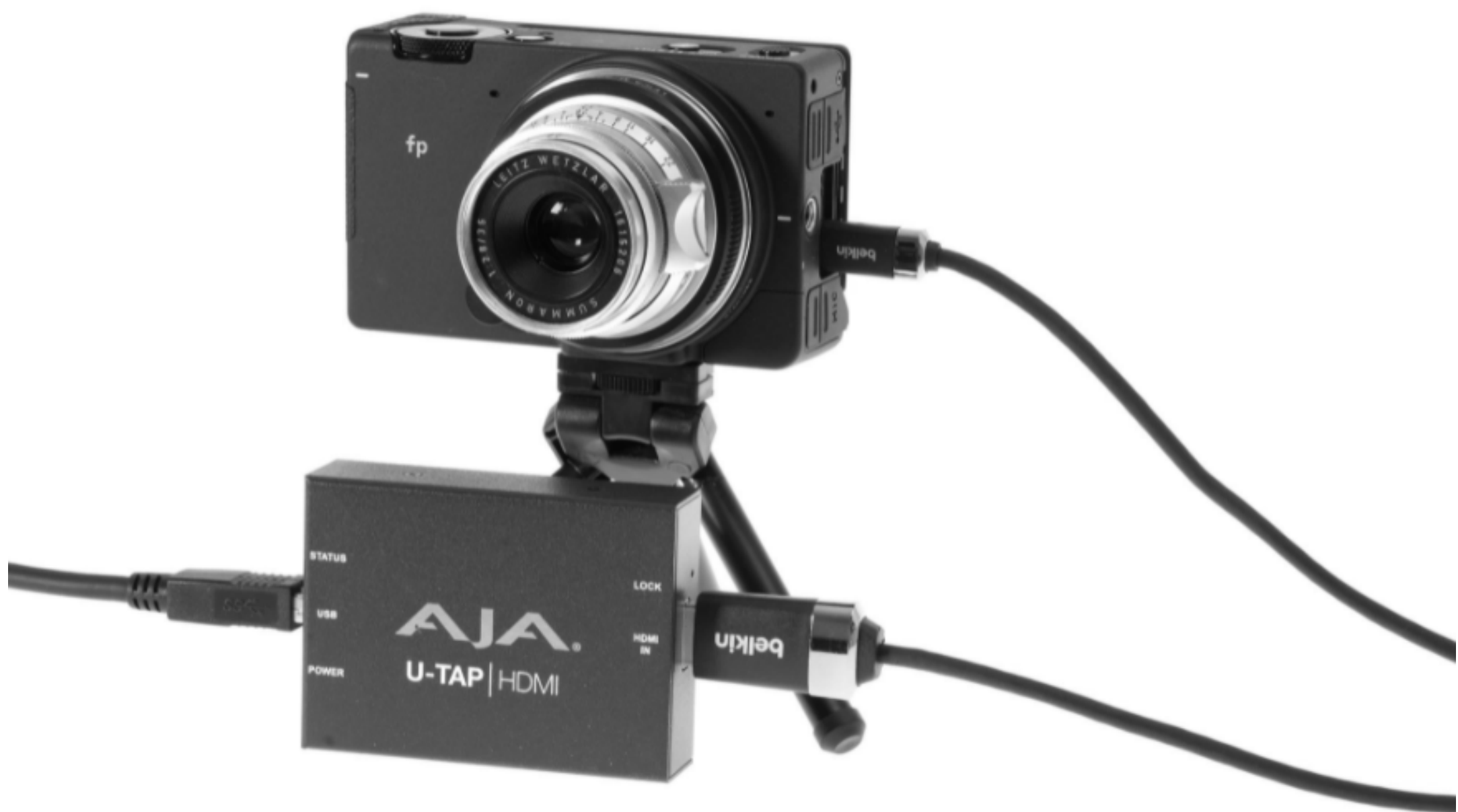
AJA U-TAP \ HDMI capture card connected to digital camera

There are plenty in the market with various price tags, but the most bank for your (higher end) buck is AJA's U-Tap converter . At close to $350, AJA is an investment but a small price to pay for beauty. Good news is there are others in the market like Blackmagic and Elgato providing more cost-effective solutions.