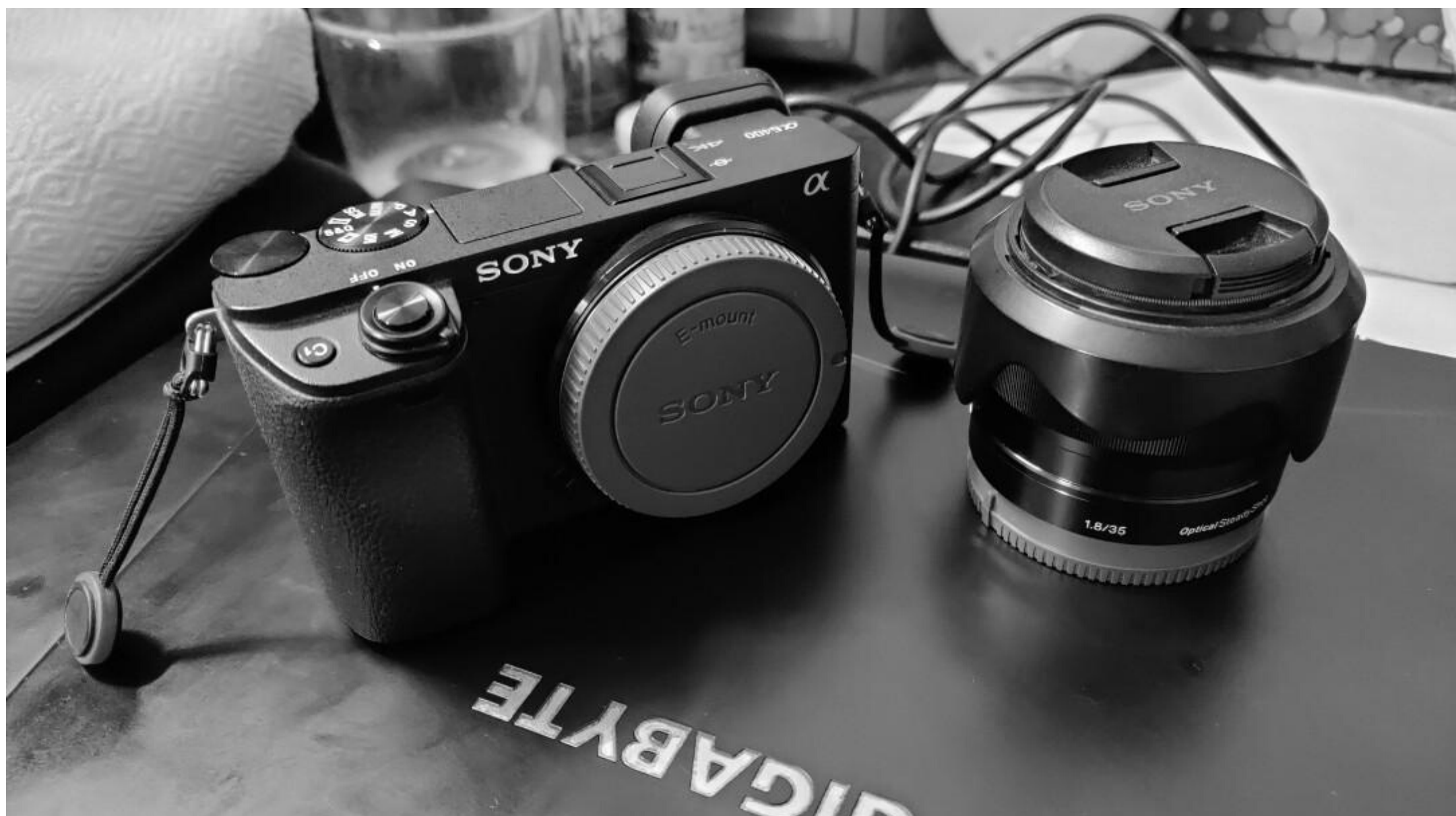
Sony a6400 + Sony 35mm f1.8 prime fixed lens

If you choose to adopt this setup yourself for livestreaming, turn off the camera screen's display data, or else it'll pull through the converter and into your feed. Follow this tutorial , which was for a different model of Sony camera, but the steps were the same. When researching a tutorial for your own camera, look for how-tos on "clean HDMI."