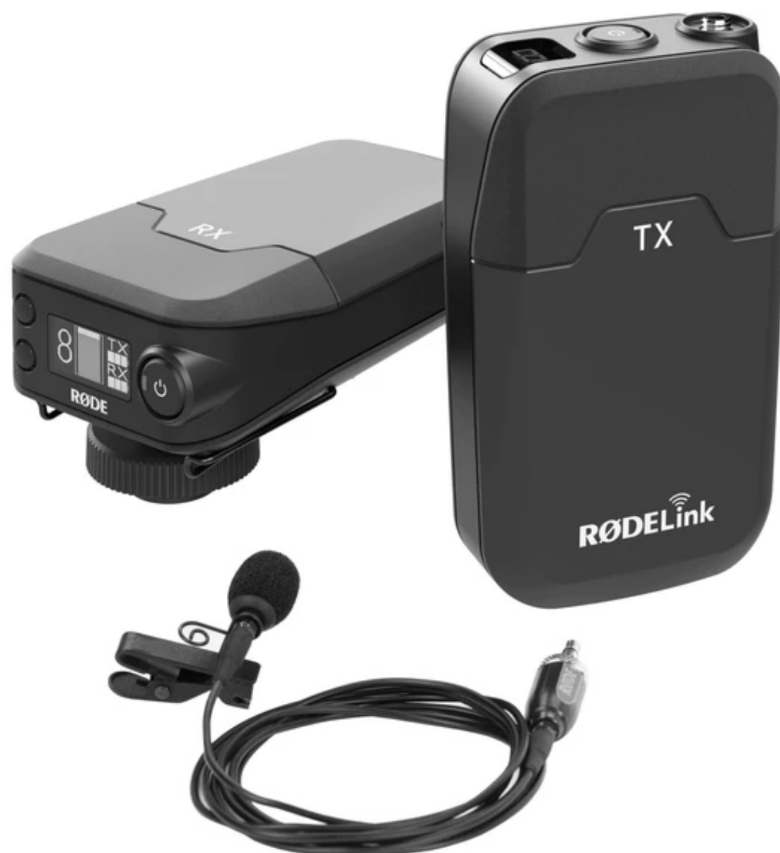
RODE RODELink wireless filmmaker kit