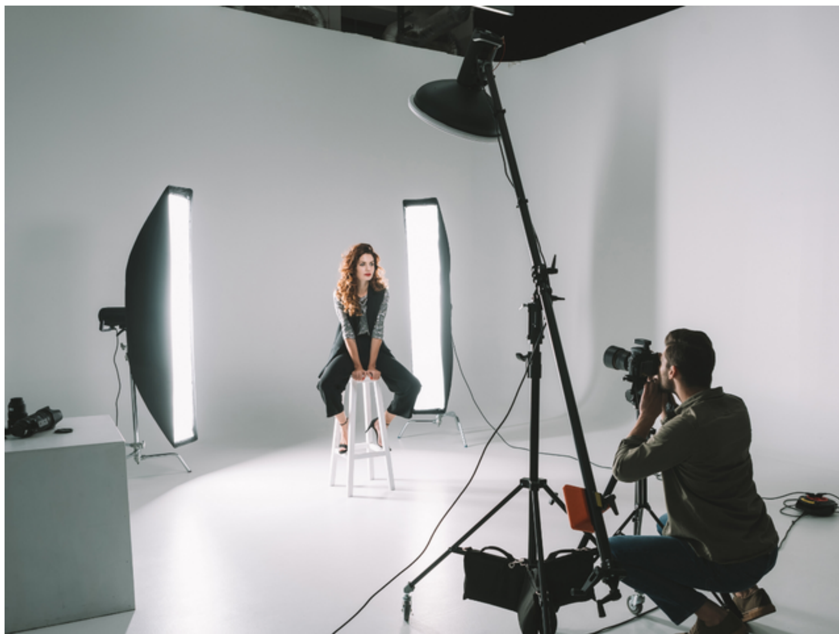
3-point light setup with central + two side lights For more lighting tips, check out this article from StudioBinder

Lighting is what makes or breaks your chance to captivate those on the other end of your Zoom call. Don't sell your visage short - let it shine consistently with solid lighting. Natural light is obviously ideal for a video setup, but can be unpredictable. Ring lights are a cheap alternative, but we aren't here for Instagram or TikTok likes. We are here to make power moves in the most beautiful way possible.